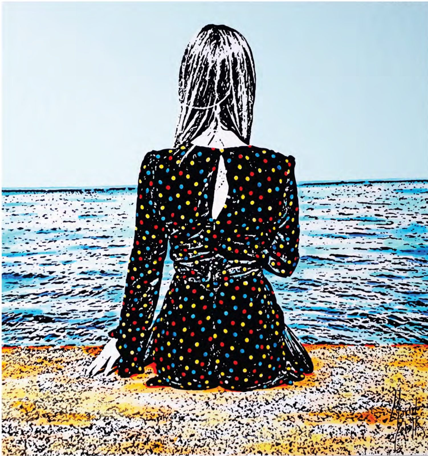
This Page, above, My Time , acrylic on printed paper, 38 cm x 40 cm Following Page, Playtime , acrylic on printed paper, 30 cm x 40 cm

The blue of the sea goes hand in hand with her palette, and the ideology of the feminine manages to anchor itself.