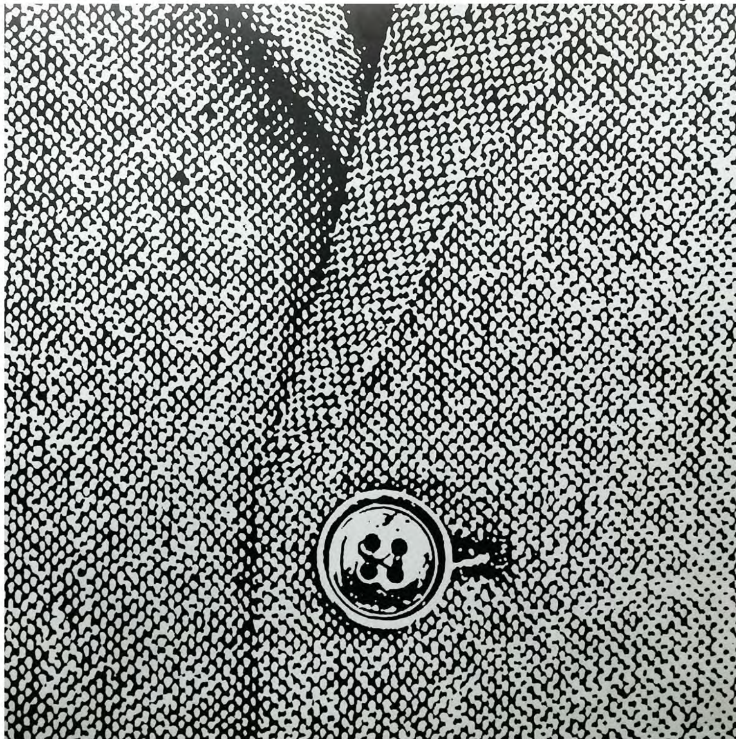
This Page, above, Artistic Sewing Series , acrylic on canvas, 140 cm x 140 cm Following Page, My Landscape , acrylic on printed paper, 30 cm x 40 cm

His painting is rational, with an orderly composition, neat, impeccably executed. They are the result of two elements: aesthetics and concept. Similar to the world of graphics, the language is very popular and understandable, figurative, with strong contrast and synthesis.