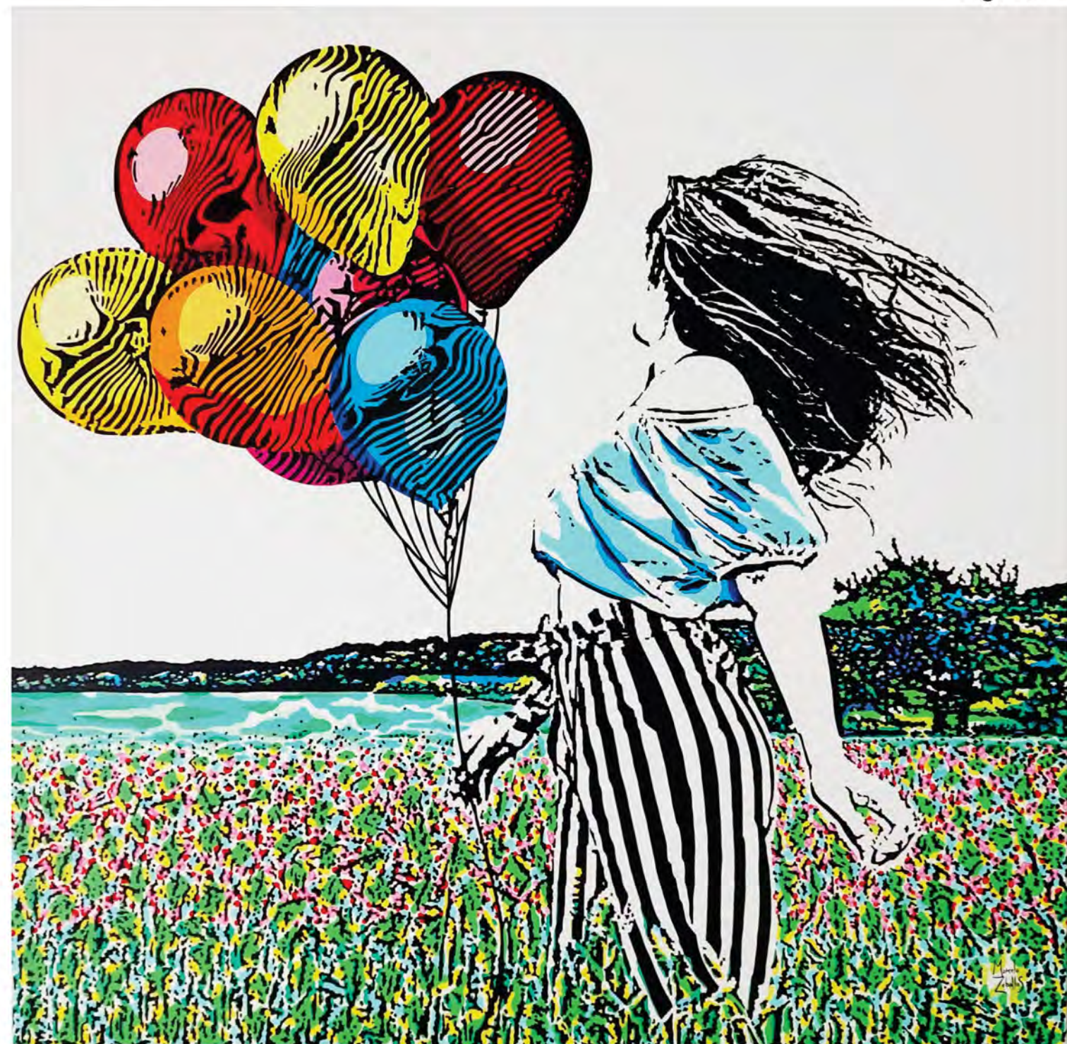
This Page, above, Celebration , acrylic on canvas, 150 cm x 150 cm

Here, frivolity is present as a virtue, and the dose of sensuality and eroticism is the strategy for an explicit message at recess.