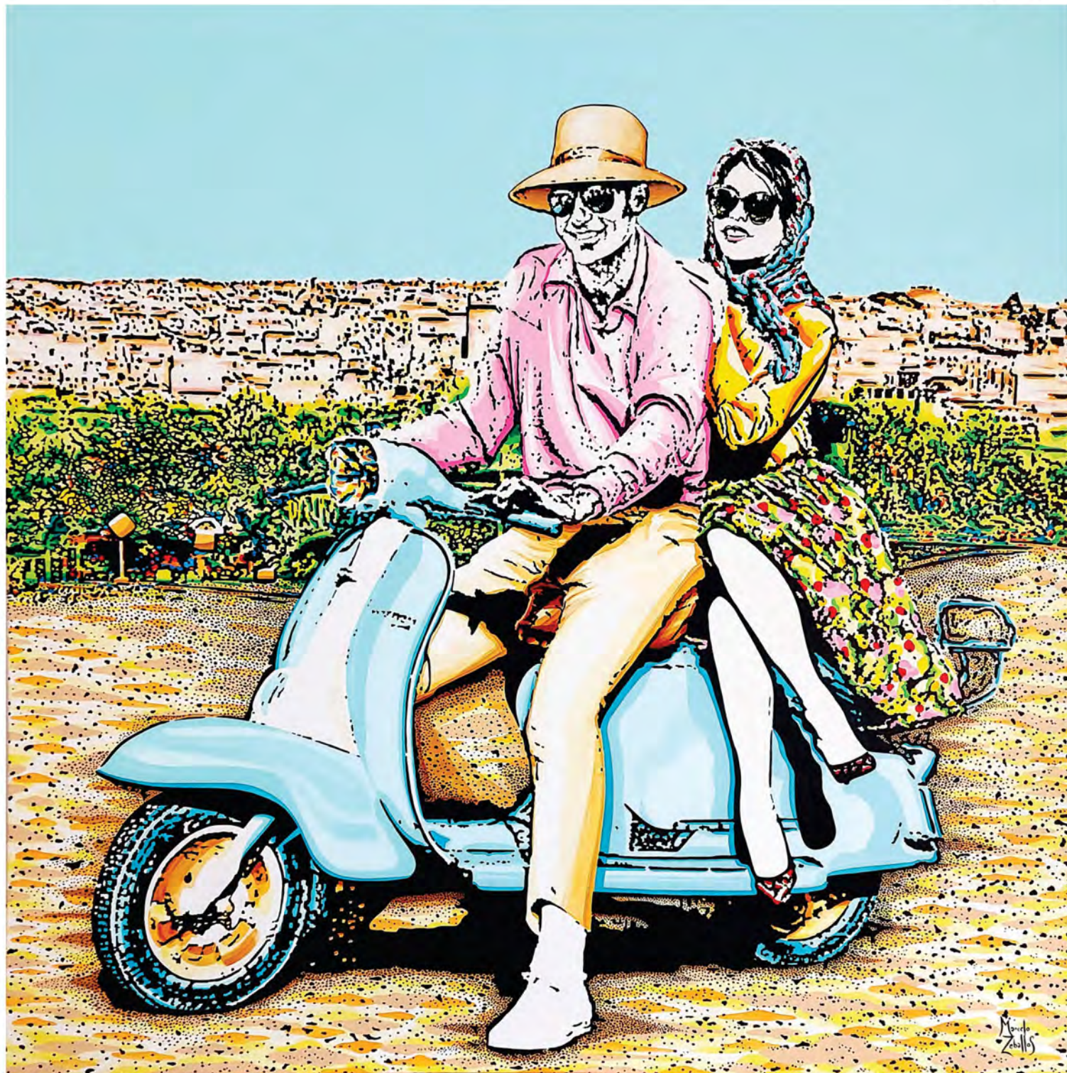
Cover Page, Paradise , acrylic on printed paper, 30 cm x 40 cm