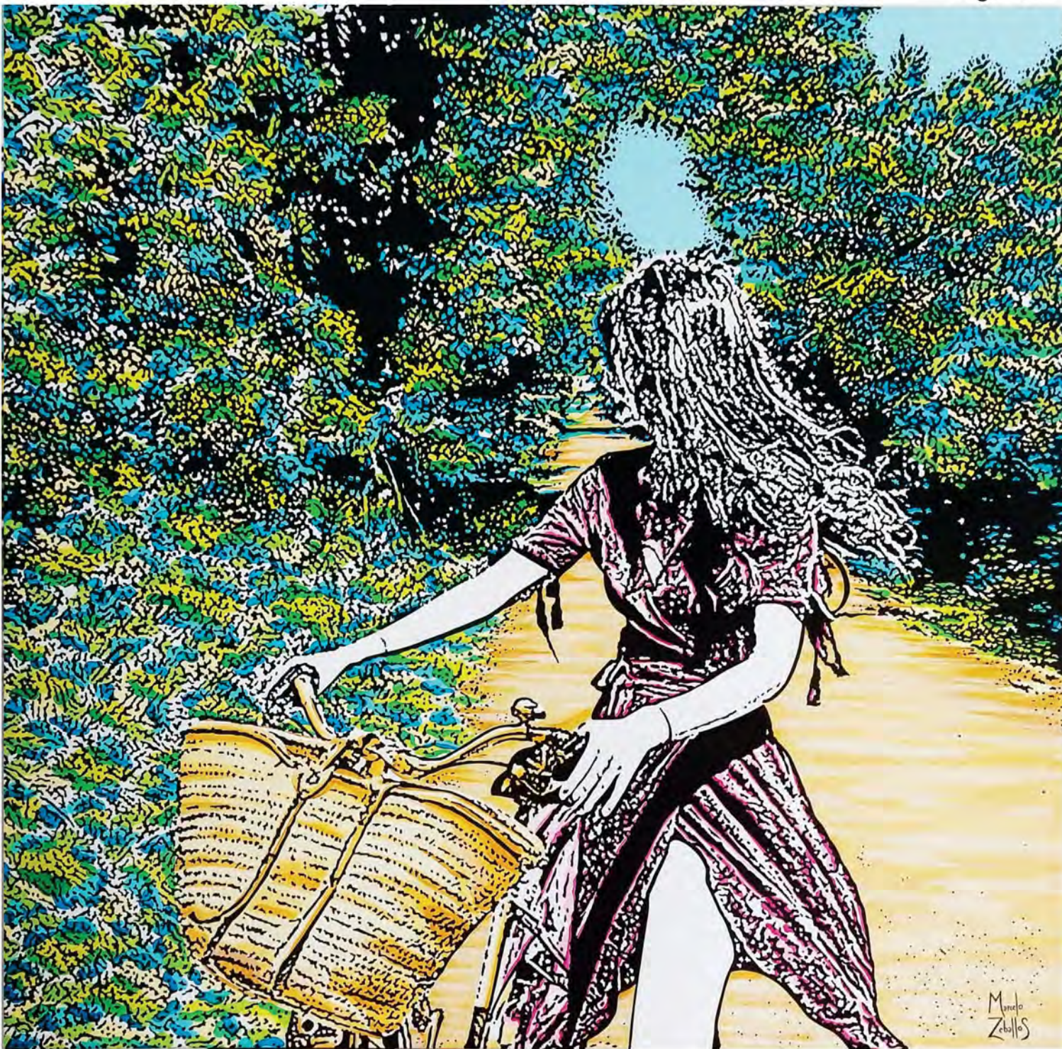
This Page, above, El Paseo , acrylic on canvas, 150 cm x 150 cm